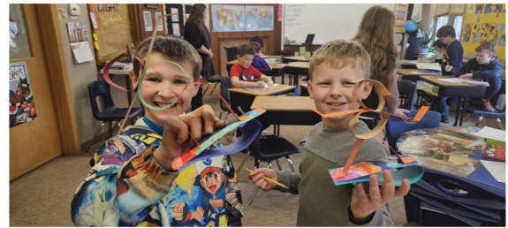
We have been learning about sculpture and 3-D art in 3rd and 4th grade. One of our fun projects was to make surfers in motion. Some of the students even chose to add waves!