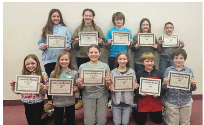
We had a fantastic time at the MN North Lutheran School's Bible Bowl at Immanuel, Walker! 4th grade earned 3rd place, 5th grade earned 2nd place, 6th grade earned 1st place, and our 7th/8th alumni team earned 2nd place. All were great representatives of our school!