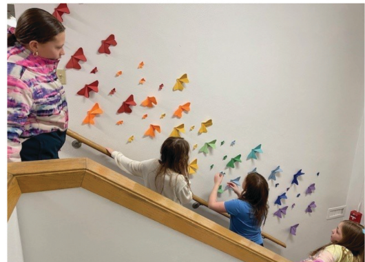
5th & 6th graders are thinking spring!