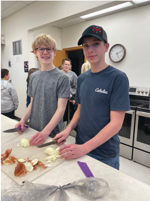
We had lots of cheerful helpers in the kitchen.