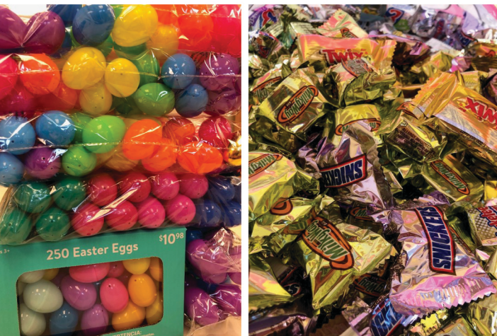
We're excited for our new “Egg My Yard” fundraiser this year—we will be stuffing and hiding 600 eggs!

Thank you to everyone who donated through our Envelope Fundraiser and our two Lenten Suppers—we appreciate your support!