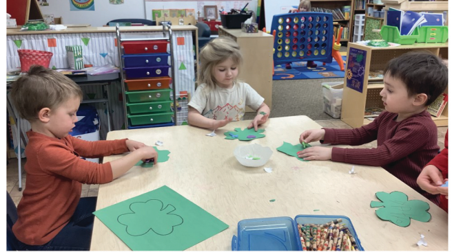
The preschoolers are making shamrocks and learning how the three leaves represent the Holy Trinity.