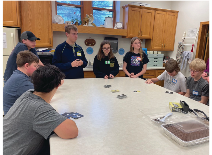
The youth had some extra time after getting everything ready for the meal, so they played a few rounds of a Bible-themed card game.